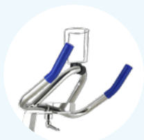
45° sport handlebar pedals