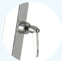
Fast settings Click & Turn