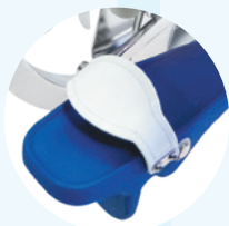
Barefoot pedals approved resistance