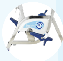
X frame geometry

The Inobike 8 has a mechanical system that combines the efficiency of a rubber brake stop with the precision of a gear lever . Adjustment is done while you are working out , without you even having to stop pedalling, by simple pressure on the gear lever, for highly accurate and simple measurement of your resistance. You therefore improve your performance while you are training