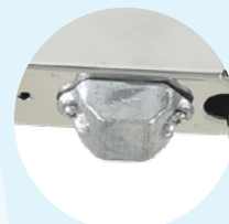
Sacrificial Anode for marine use