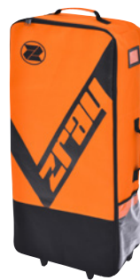
Premium Transport bag