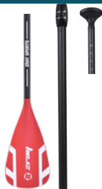
Elite aluminium paddle