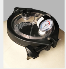
Easy-to-read pressure gauge for simple control