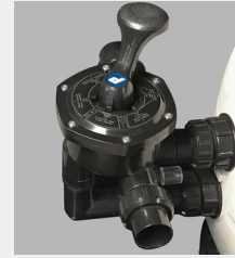
Equipped with a 6-way multiport valve made of robust ABS and stainless steel