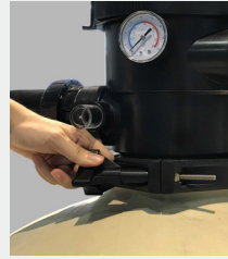
Clamp with screw lock for easy installation and tool-free maintenance

These filters are suitable for a variety of applications, from residential pools to public aquatic complexes, and offer exceptional filtration, rock-solid durability and ease of maintenance, making them the ultimate choice for those who demand superior water quality.